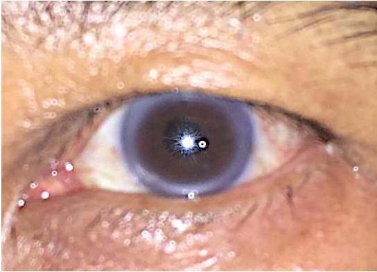
Figure 2. Follow up time at 6 th month.